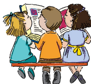
Share God's Word